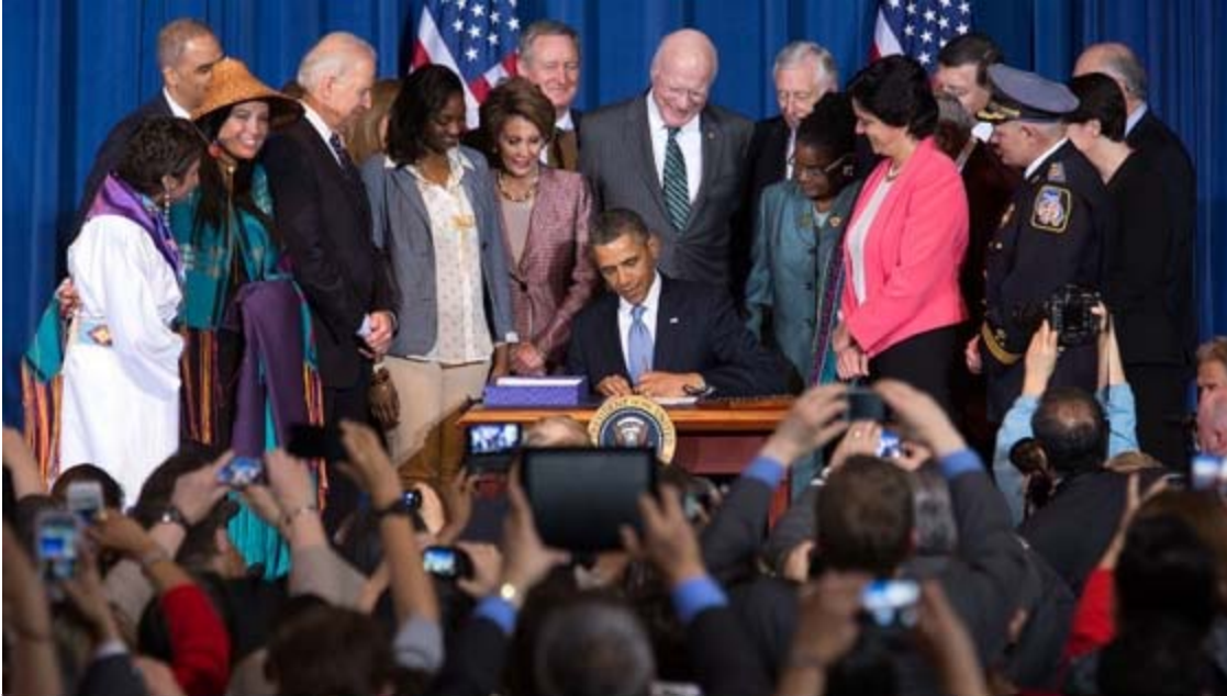
President Barack Obama signs S. 47, the “Violence Against Women Reauthorization Act of 2013,” (VAWA) in the Sidney R. Yates Auditorium at the U.S. Department of Interior in Washington, D.C., March 7, 2013.

It is up to all of us to ensure victims of sexual violence are not left to face these trials alone. Too often, survivors suffer in silence, fearing retribution, lack of support, or that the criminal justice system will fail to bring the perpetrator to justice. We must do more to raise awareness about the realities of sexual assault; confront and change insensitive attitudes wherever they persist; enhance training and education in the criminal justice system; and expand access to critical health, legal, and protection services for survivors.